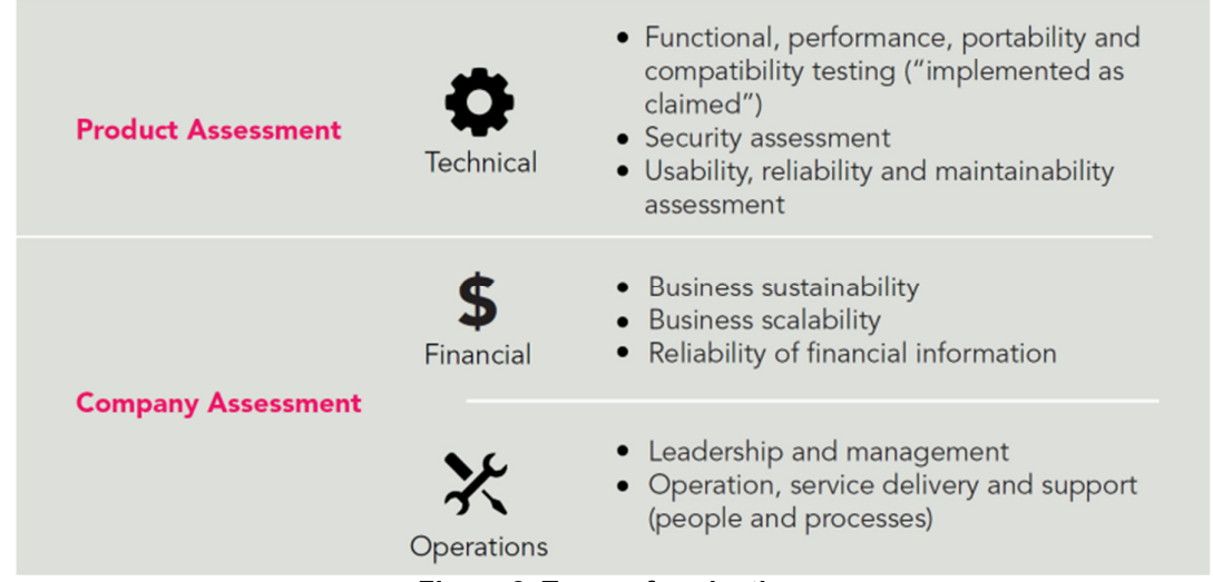
Figure 2. Types of evaluation.

4.1.1 The accreditation evaluation encompasses a holistic evaluation of the company in the three key areas as depicted in the following diagram (see Figure 2). All evaluation is conducted by the Accreditation@SGD team in IMDA, or where necessary, by 3rd party assessors appointed by or in partnership with IMDA.