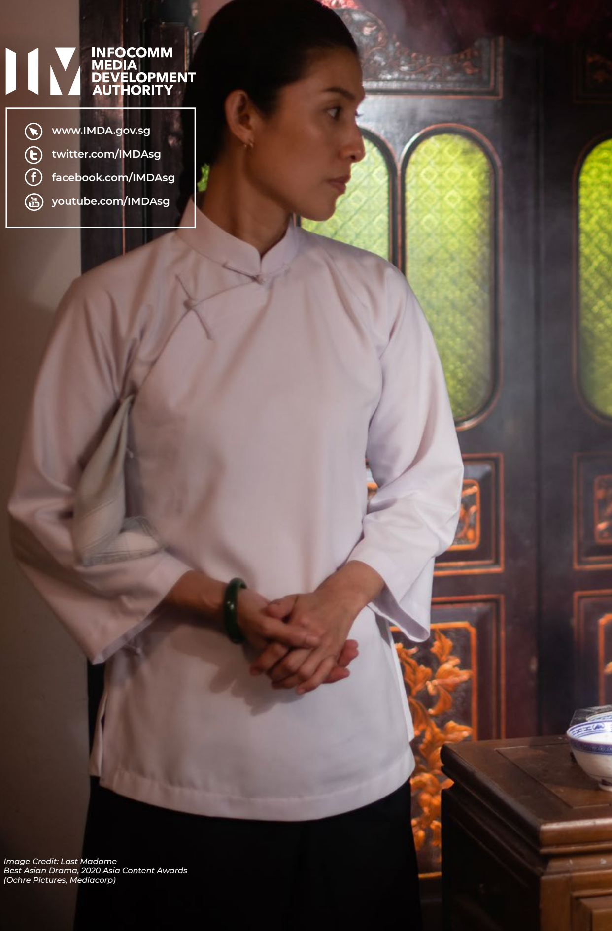
Image Credit: Last Madame Best Asian Drama, 2020 Asia Content Awards (Ochre Pictures, Mediacorp)