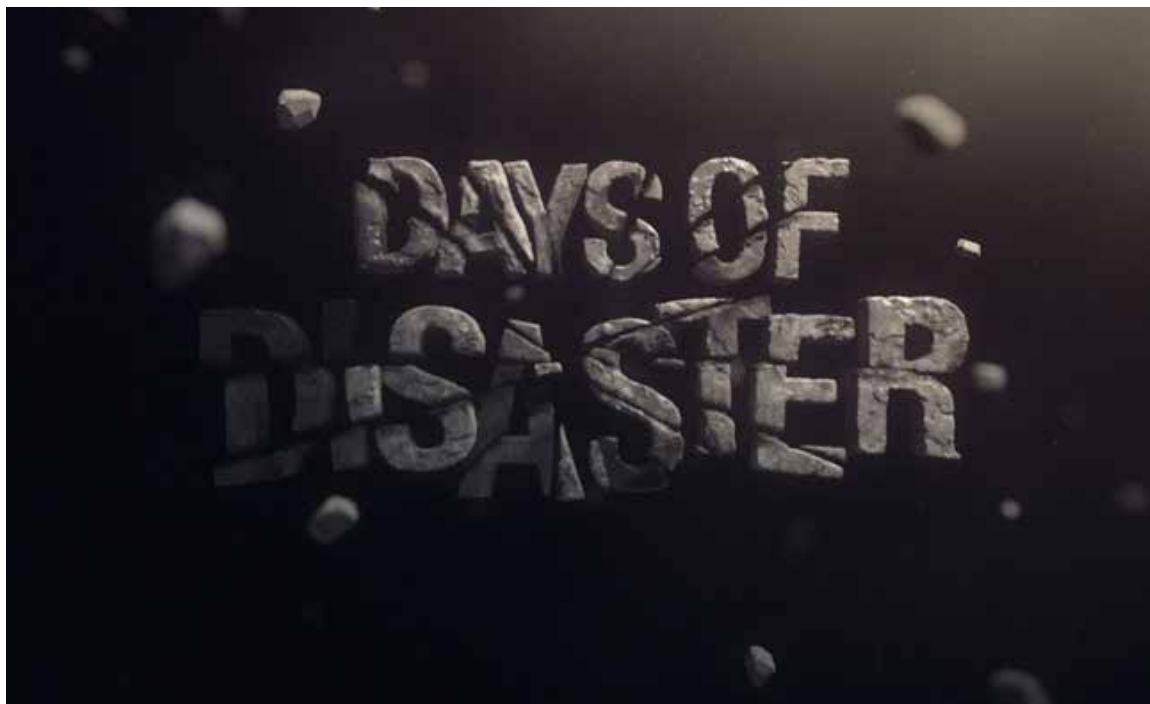
Channel NewsAsia's Days of Disaster – a reminder for us to stay vigilant.

Larger budgets from PSB funding meant that Singaporeans were treated to more high-quality made-in-Singapore documentaries this past year. Programmes such as Raffles Revealed and Days of Disasters were met with rave reviews from viewers islandwide.