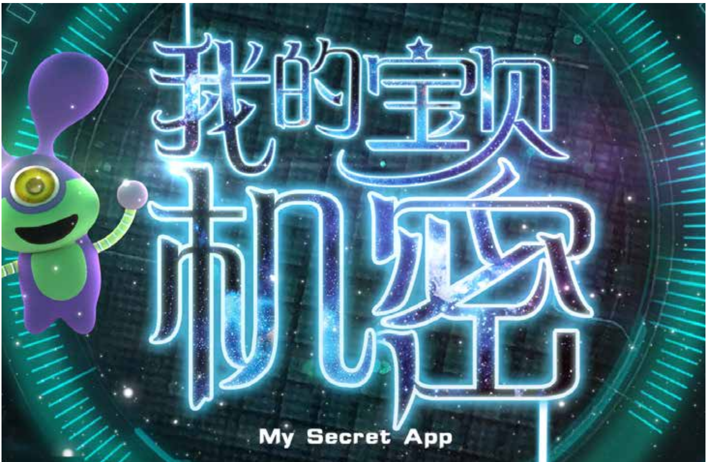
My Secret App (我的宝贝机密), produced by StarHub with MDA's support, premiered on 26 May 2015.

The programmes will also be available to the public for free on StarHub Go (formerly known as 'StarHub TV Anywhere') six months after their telecast.