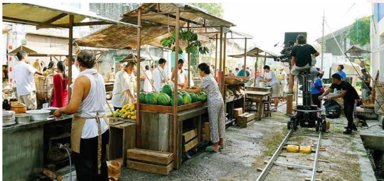
On the sets of the film, 'Long Long Time Ago'

Supported by award-winning talent and strong international networks, stories created here are built to travel further and resonate worldwide.