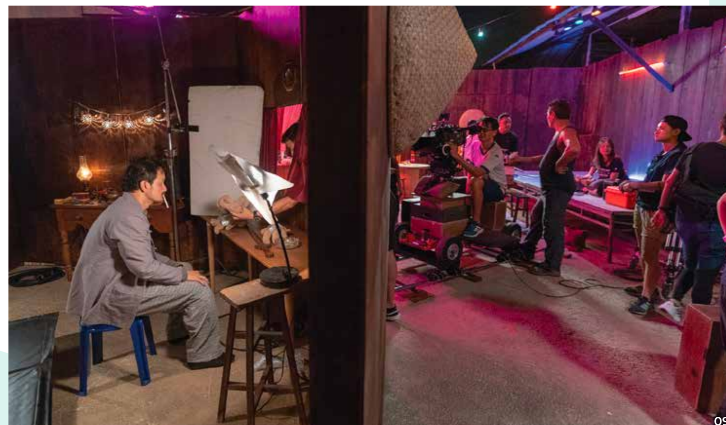
On the sets of the film, 'When Ghost Meets Zombie'

For more information about using the ATA Carnet and the countries that recognise it, please visit the Singapore International Chamber of Commerce website .