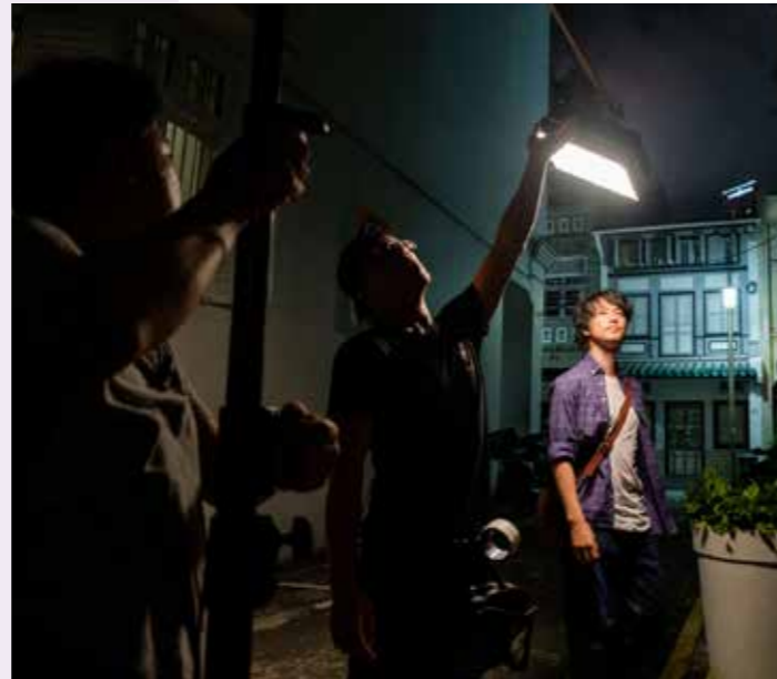
On the sets of the film, 'Ramen Teh' at Chinatown, Singapore