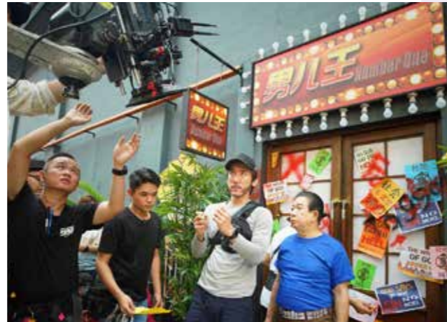
On the sets of the film, 'Number 1'

For helicopter filming, please contact CAAS at CAAS_ATS_ANSP@caas.gov.sg or visit their website for more information.