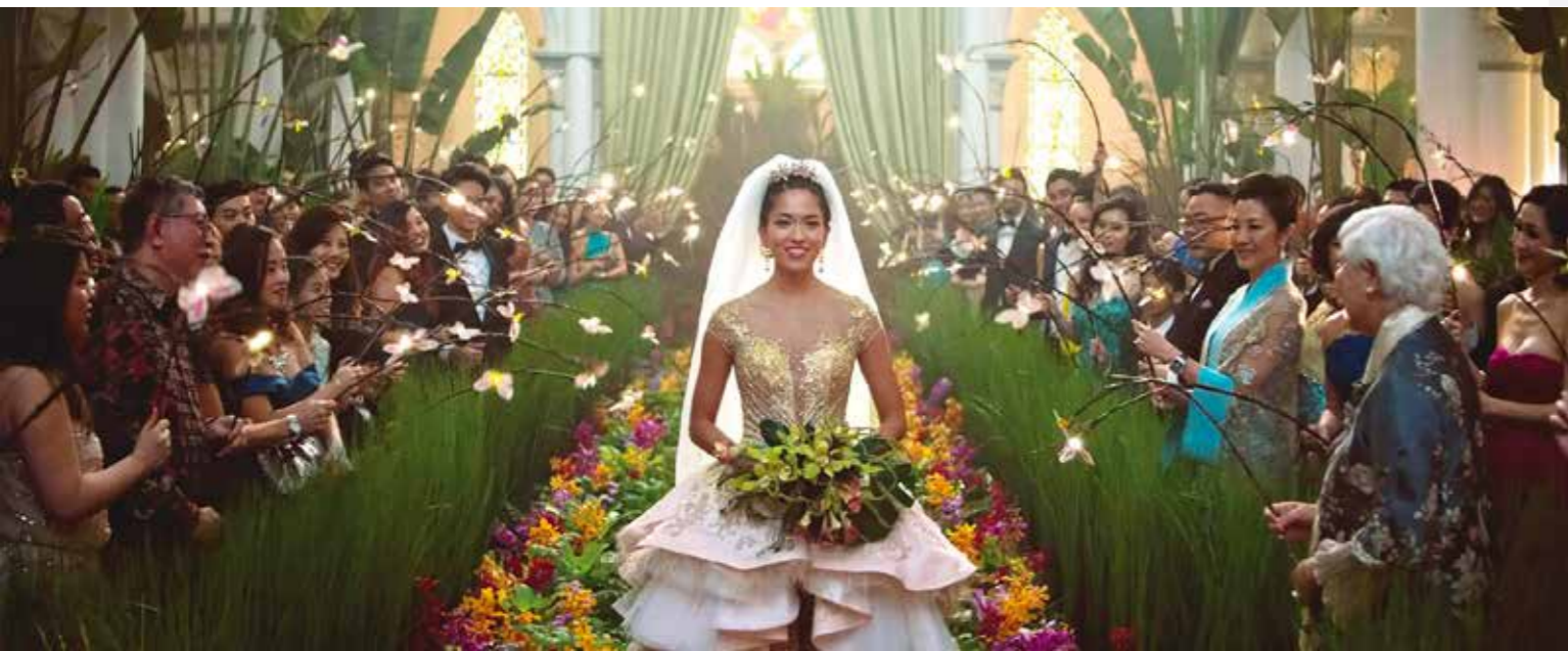
Grand wedding scene from ‘Crazy Rich Asians’ that was shot in CHIJMES, Singapore