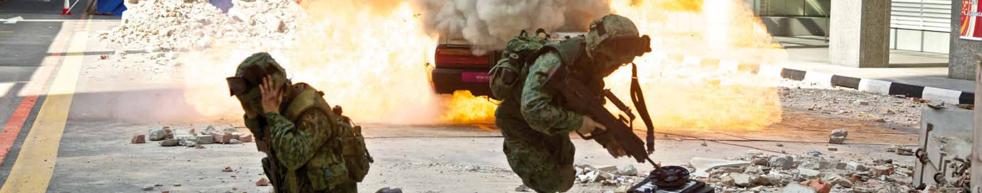
Action scene being shot for the 'Ah Boys to Men' film series.