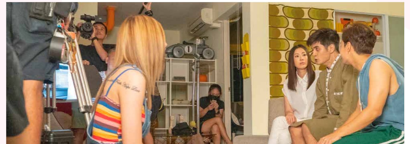
On the sets of the film, 'When Ghost Meets Zombie'

Women who are 6 months or more than 6 months pregnant and intend to enter Singapore for social visits should make a prior application through the nearest Singapore overseas mission .